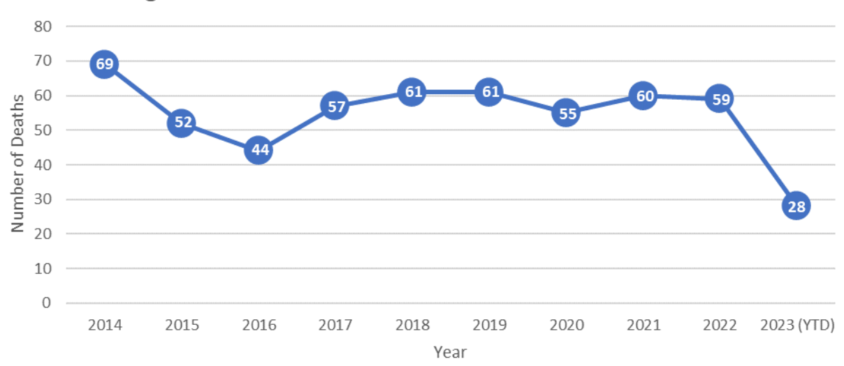
Fig. 1: 10 Year Trend in Suicides Observed at DC OCME

OCME observed an average of 55 suicides per year over the last decade (Fig. 1). As of August 31, 2023, 28 suicides were investigated.